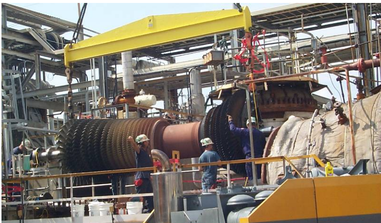
On-Site Major Overhaul of a Gas Turbine

Our experts also give tailor-made training courses on site or in our facilities using test/demo. equipment.